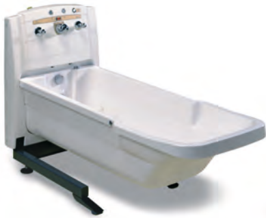
TR 900 Available with stainless steel tub