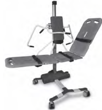
TR 9650 Stretcher/Combilift