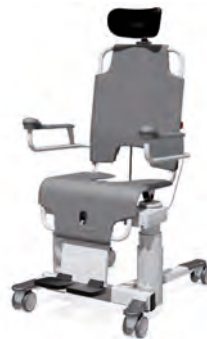
TR 1000 Battery operated height adjustment and tilt