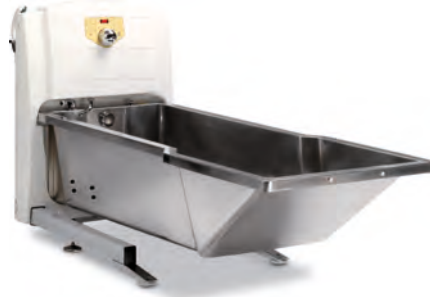
TR 900A Available with fibre glass tub