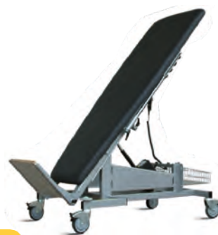
TR Classic Tilt table

TR Equipment offers a tilt table used for rehabilitation purposes