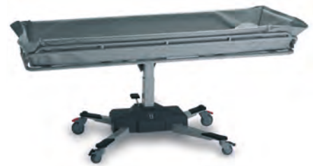
TR 2000 Available with various stretcher lengths