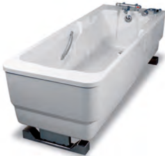
TR COMFORTLINE II Available in fixed height version