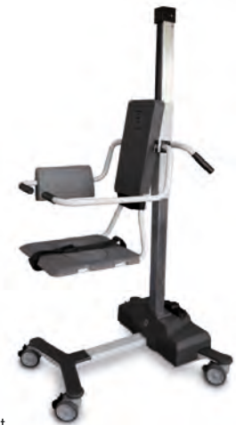
TR 9650 Chairlift