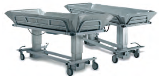
TR 4000 ATLAS Working Load Limit: 450 kg/1000 lbs