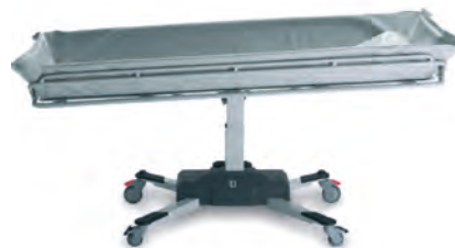
TR 3000 Available with various stretcher lengths